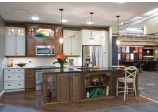
Qualico's Design Centre conveniently features displays with all the materials that go into finishing a new home.

Daniels also notes that Qualico has implemented an environmental stewardship program, which reflects "good corporate citizenship, good business and good sense." One aspect of the program is Qualico's goal to achieve a 75 percent reduction of all building product waste.