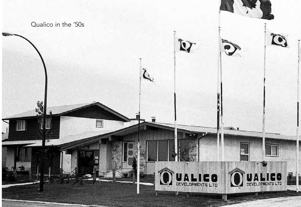
Qualico in the '50s