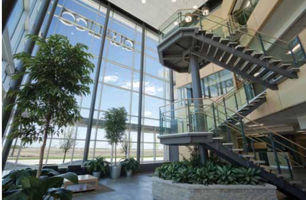
Qualico's headquarters in Sage Creek incorporates the latest eco-friendly technology.

"Even with the best practices, some building material waste is generated," he explains. "Our recycling initiative will divert close to 1,100 tons of wood waste and other construction debris from municipal landfills every year."