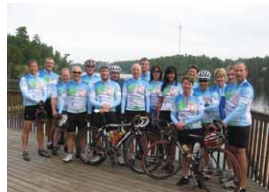
Team Qualico rides for Habitat for Humanity.