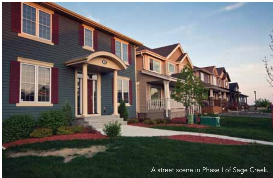
A street scene in Phase I of Sage Creek.

Qualico Communities undertook its first significant exercise in working with builders and architectural controls in the upscale neighbourhood of River Pointe in St. Vital.