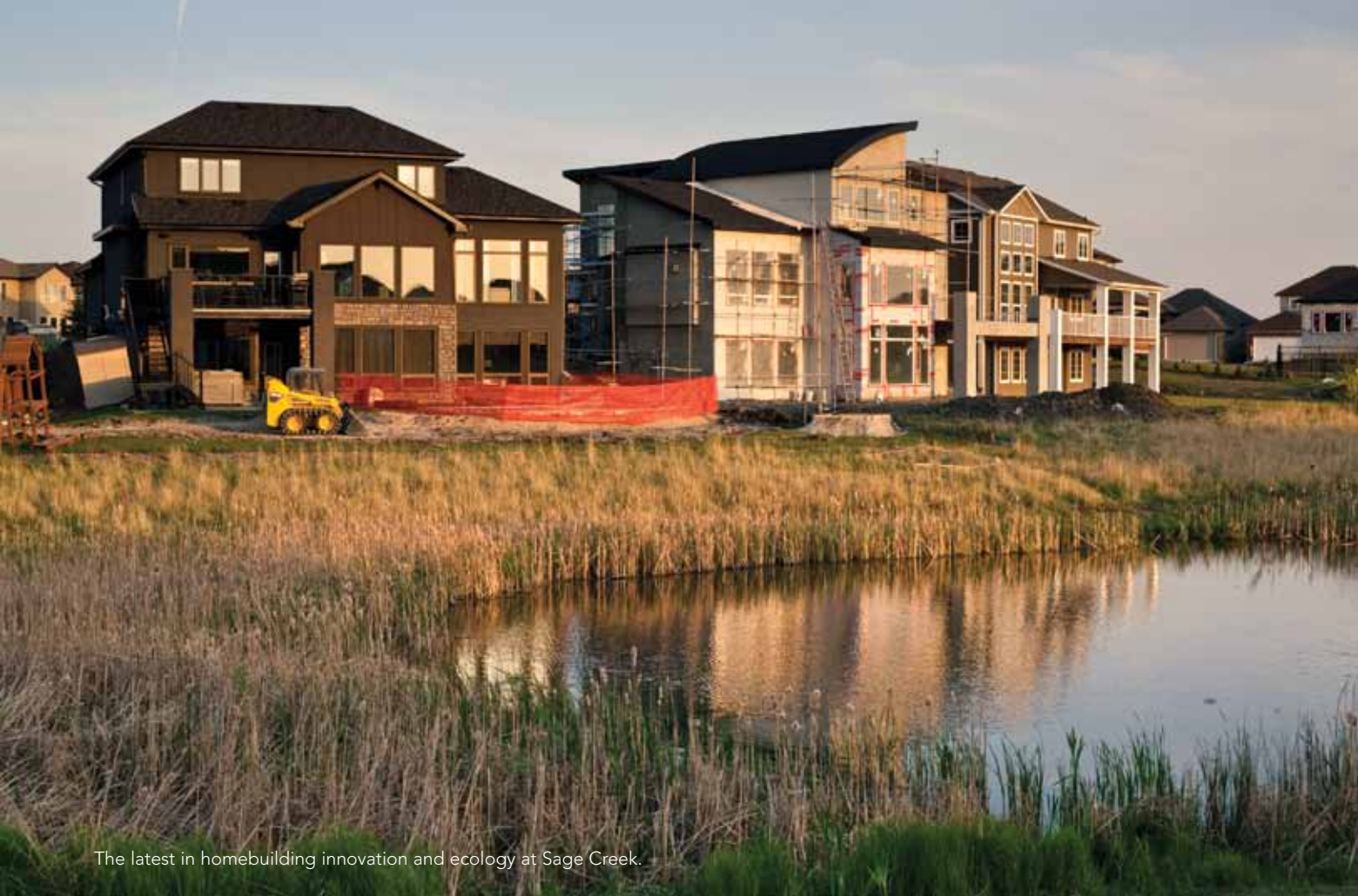
The latest in homebuilding innovation and ecology at Sage Creek.

“With River Pointe, we established good relationships with Winnipeg’s custom and luxury builders that we still enjoy to this day. And we demonstrated that our commitment to and administration of architectural controls will result in enduring quality and highly sought-after neighbourhoods,” notes Vogan.